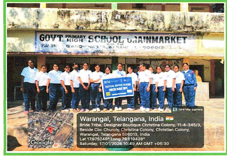
Caption: "Swachh Bharat, Swasth Bharat – Cleanliness is Our Responsibility."