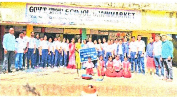
పాఠశాల ఉపాధ్యాయులతో ఎన్ఎస్ఎస్ విద్యార్థులు

వీలావరంగల్, జనవరి 17 (ఆంధ్రజ్యోతి) : నగరులోని గాంధీనగర్లో గల గ్రెయిన్ మార్కెట్ ప్రభుత్వ పాఠశాలలో ఎన్ఎస్ఎస్ యూనిట్ వర్కీ డీవీసీ ఆగ్రికల్ ల్యూర్ ఎన్ఎస్ఎస్ వలంటీర్ల ఆధ్వర్యంలో శనివారం స్వచ్ఛభారత్ కార్యక్రమం చేపట్టారు. ఈ సందర్భంగా ఆగ్రికల్ ల్యూర్ డీవీసీకి చెందిన వాలంటీర్లు పాఠశాలలో పాటు పరిసరాలను శుభ్రం చేశారు. పరిశుభ్రత, పాఠశుభ్రం, పౌర బాధ్యతల పై ప్రజలకు అవగాహన కల్పించారు. పాఠశాల హెచ్ఎం, ఉపాధ్యాయులు విద్యార్థులు ఎన్ఎస్ఎస్ వలంటీర్లను సహకరించి స్వచ్ఛభారత్ కార్యక్రమంలో పాల్గొన్నారు. ఎన్ఎస్ఎస్ యూనిట్ వర్కీ విద్యార్థులు చేపట్టిన కార్యక్రమం సామాజిక చైతన్యాన్ని పెంపొందిస్తాయని హెచ్ఎం, ఉపాధ్యాయులు అన్నారు. ఇలాంటి సేవా కార్యక్రమాలను కొనసాగించాలని అన్నారు ఎన్ఎస్ఎస్ వర్కీ వలంటీర్లు, హెచ్ఎం, ఉపాధ్యాయులు పాల్గొన్నారు.